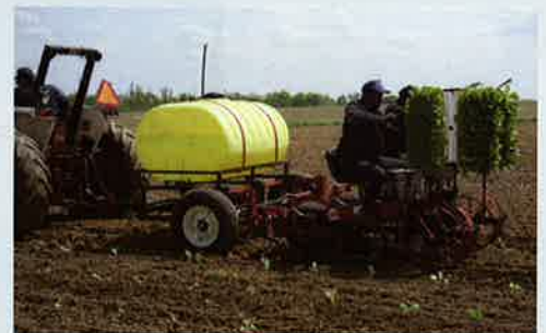
Complete Model 800 2 6000 planting tobacco in Kentucky.

The Model 6000 has the same deluxe features as our popular Model 4000 Metering Unit. It is 30% larger to handle taller, leafier plants like tobacco and cabbage. Or patented kicker arm and shoe design gives uniform control of plant placement. The one person operation to feed the proven four cup metering top design means big savings on labor. Planting speeds of 3000 to 5000 plants per hour have been recorded. Our patented Float Wheel Direct Drive System provides accurate spacings, firms and smooths soft soil conditions and allows the unit to float independently. This helps maintain uniform depth control and accurate cell placement in all types of field conditions. The drive system also enables you to change to a full range of spacings in seconds. The Model 6000 is a proven winner. It's fast, efficient, and easy to use.