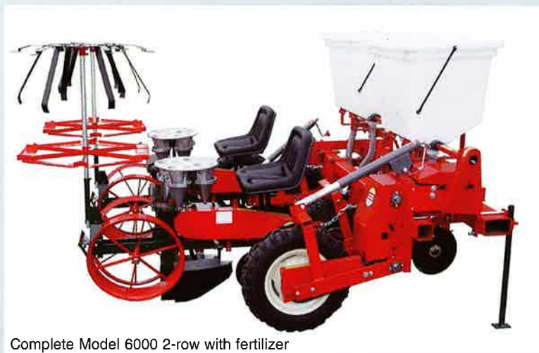
Complete Model 6000 2-row with fertilizer

Options shown on above models include: cushion seats, carousel tray holders, fertilizer hopper, 4 x 7 toolbar and deluxe crank type gauge wheels