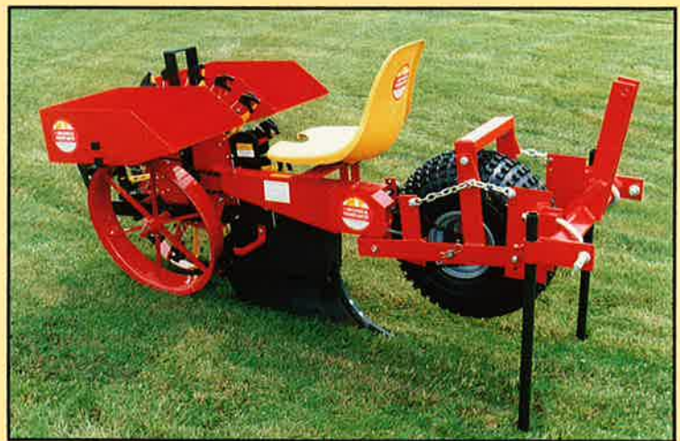
Model 550LU Planting Unit Shown Separately (Optional 3 point single row hitch and stand shown)