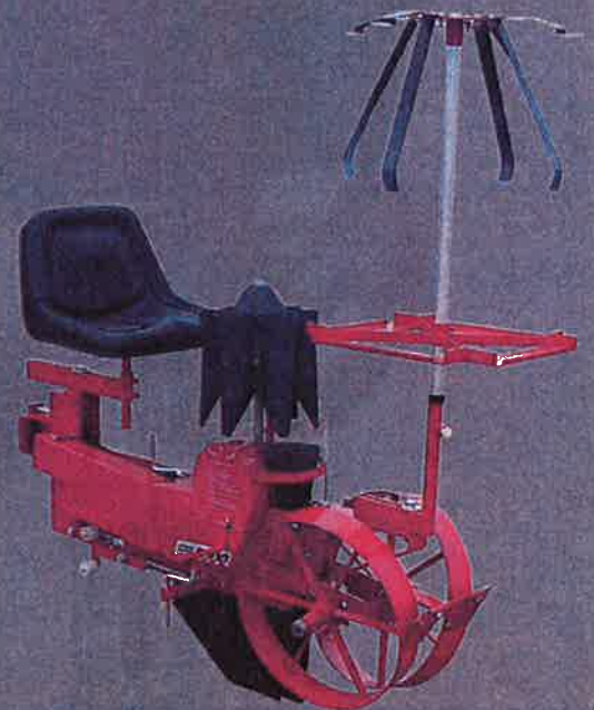
5000W unit with the optional cushion seat and 5600 carousel tray holder

Mechanical Transplanter Company * 1150 Central Avenue * Holland, MI 49423