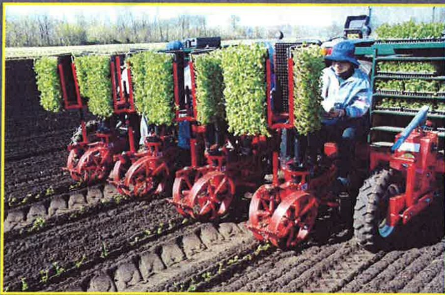
4-Row Model 5000W with EZ-17 gauge wheel drive system