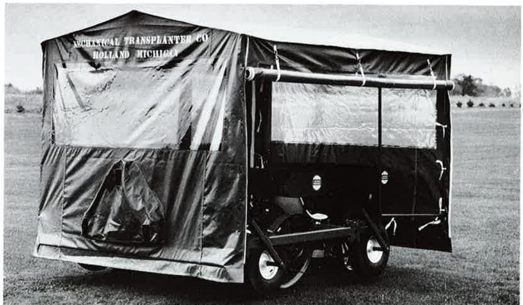
Our Five Row Bed Planter Model No. 500-5 with Vinyl Canopy for All-Weather Planting

We Now Have a Planter for Every Transplanting Situation from the Smallest to the Largest Plants. Ask Us to Quote on All Your Special Needs.